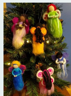
Tatiana's felted needle fairies