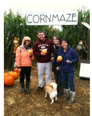
At Pumpkin Patch