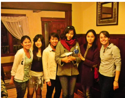
After the Asian Feast... photo time!