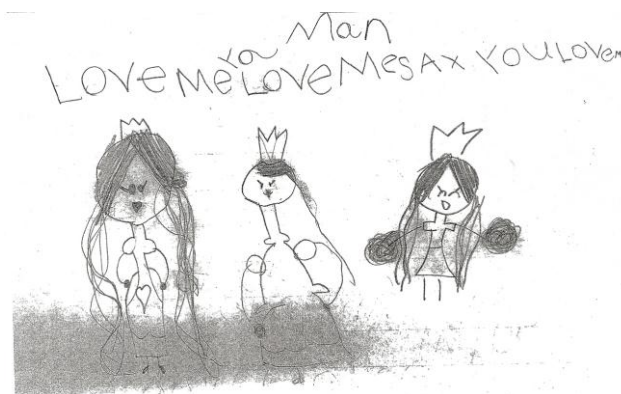
Figure 3. Princesses, cheerleading, and Justin Bieber

Example 3: Describing activities they like. This student writes the chorus from the Justin Bieber song Love Me. She writes, “Ya Man, LOVeMeLOVeMeSAY YouLOVeM” Translation: “Ya man. Love me, love me, say you love me.”