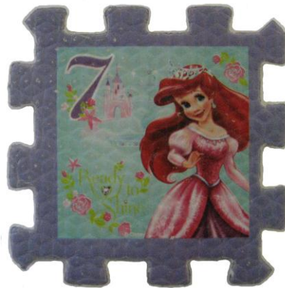
Figure 4. Classroom toy

Classroom resources. Classroom resources can also sponsor spontaneous remarks about gender identity. Below we share a conversation a student initiated in relation to fairy-princess puzzle pieces in the classroom. Two girls approached Mr. Wacker proudly with a green bin that contained puzzle pieces put together in the form of a cake. They removed one piece from the puzzle cake and handed it to him.