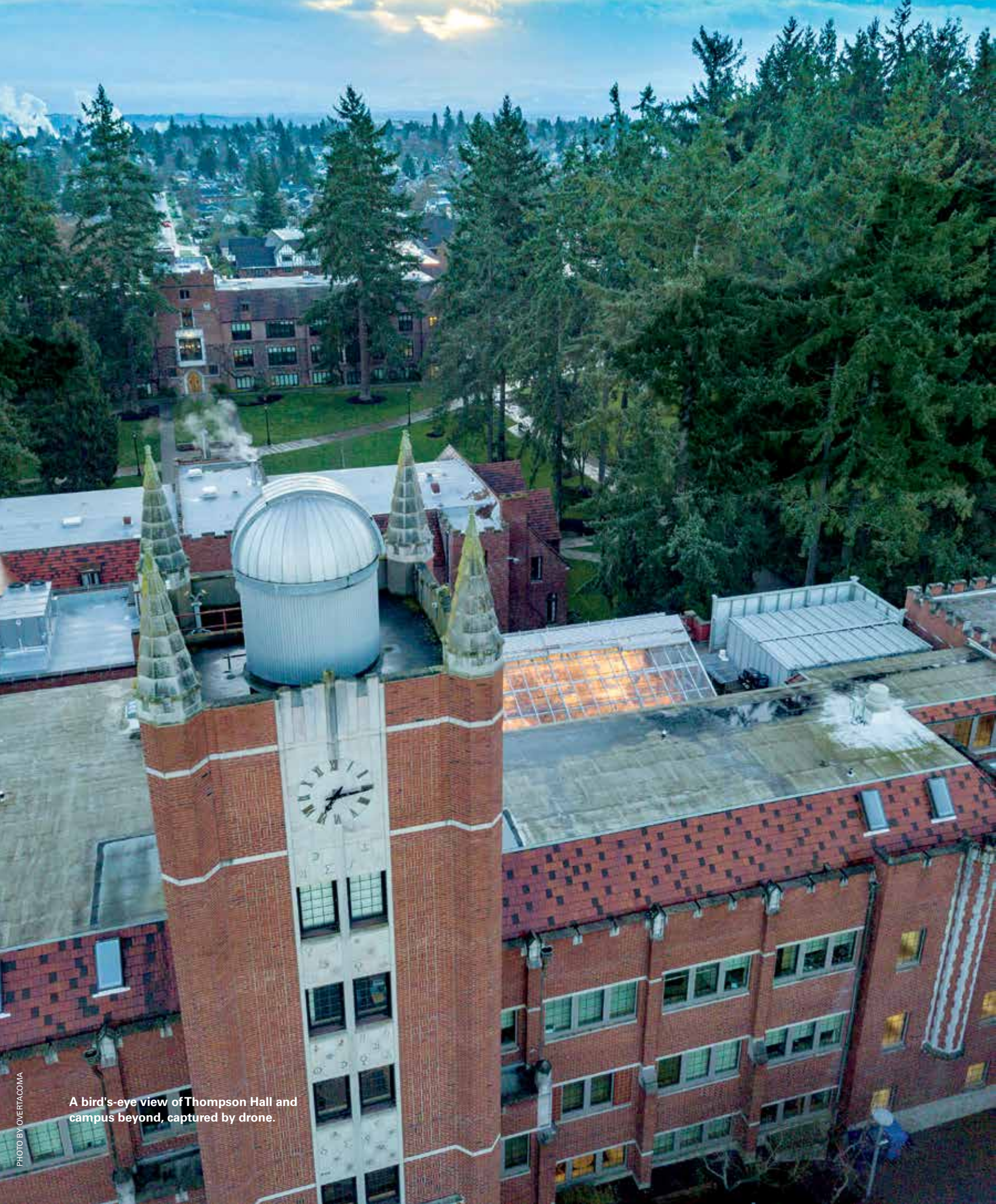
A bird's-eye view of Thompson Hall and campus beyond, captured by drone.