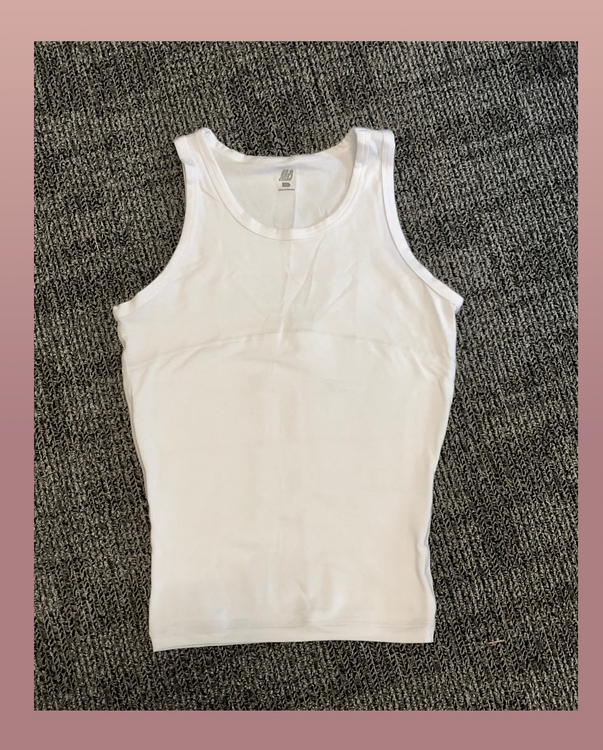
Leo by Leonisa Firm Compression Tank