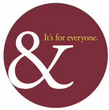
Table of Contents NCPTW 2016